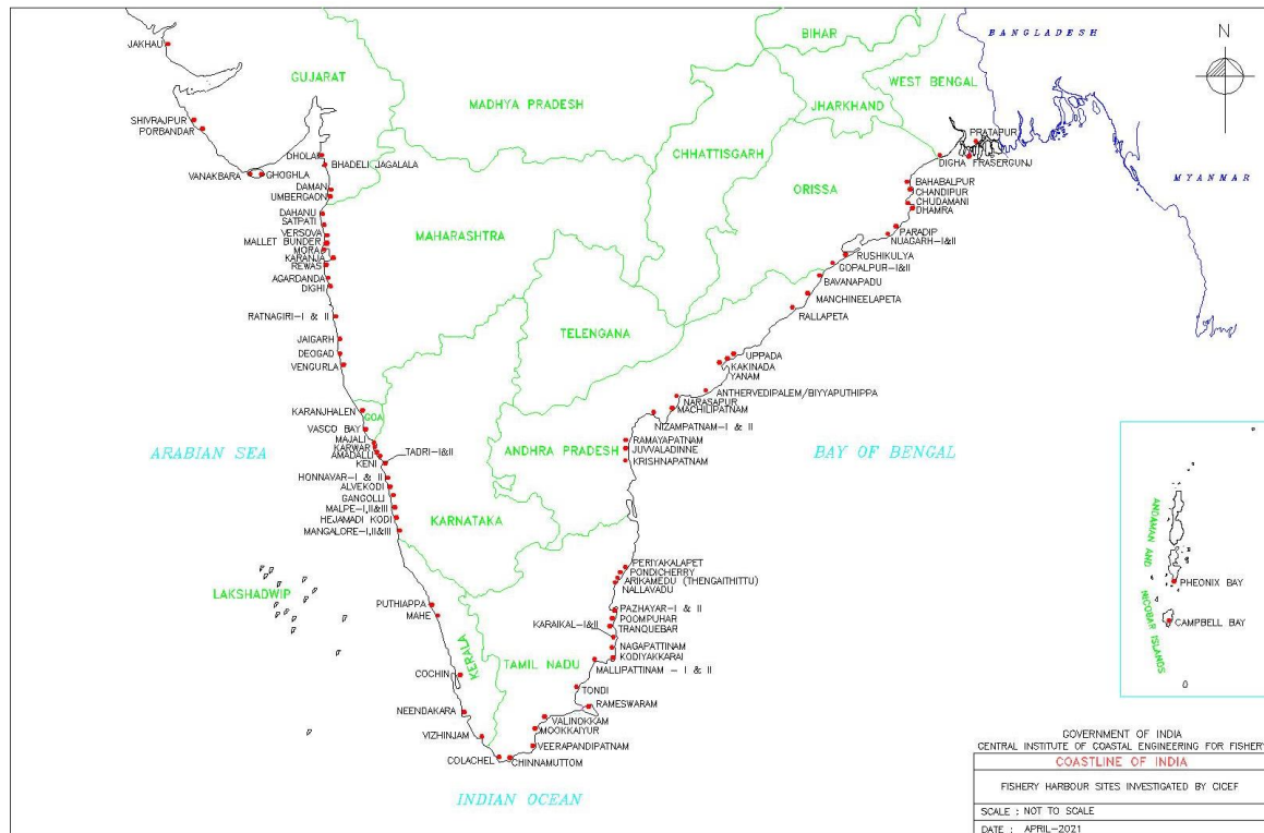
Map showing fishery harbour sites investigated by CICEF

During UNDP/FAO assistance, four pilot brackish water shrimp farms and one shrimp seed hatchery were developed. Under the World Bank assisted Shrimp Culture Project, the Institute carried out survey and sub-soil Investigations at 13 sites covering a total area of 9640 ha. Techno-economic feasibility reports were prepared in respect of 10 sites covering a total productive pond area of 3826 ha. Trial culture operations were carried out at Digha, Canning and Dighirpar in West Bengal and Bhairavapalem in Andhra Pradesh.