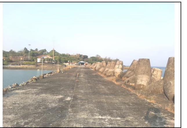
Pre-Feasibility studies in Andaman and Nicobar Islands