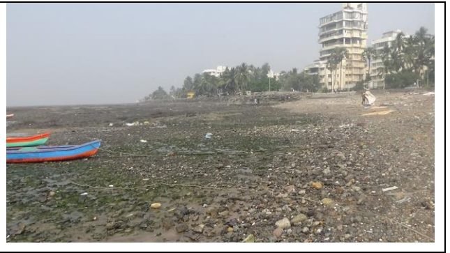
Pre-Feasibility studies Phase-2 in Maharashtra